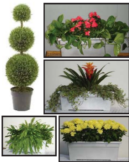
Planters are 2 1/2' long.

7' H & Taller plants & Planters are available Call 770-507-6777 for price/availability